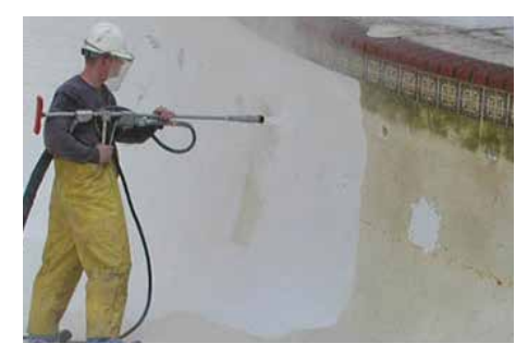
Removal of paint, rust and graffiti from steel and/or concrete surfaces