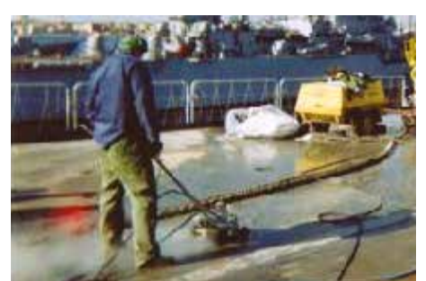
Cleaning ships' decks