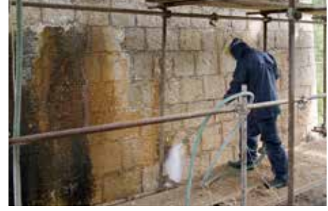
Cleaning building scaffolding