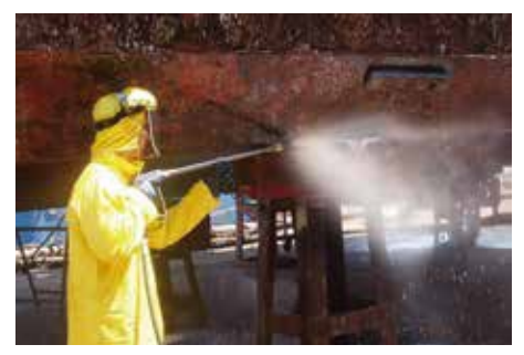
Cleaning ships' hulls