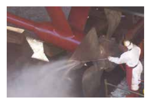
Removal of scale deposits and/or marine fouling