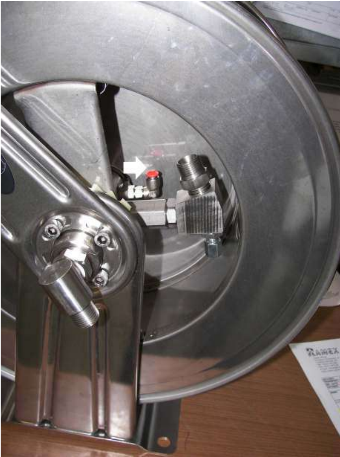
Connect the "Rilsan" hose on the quick connector