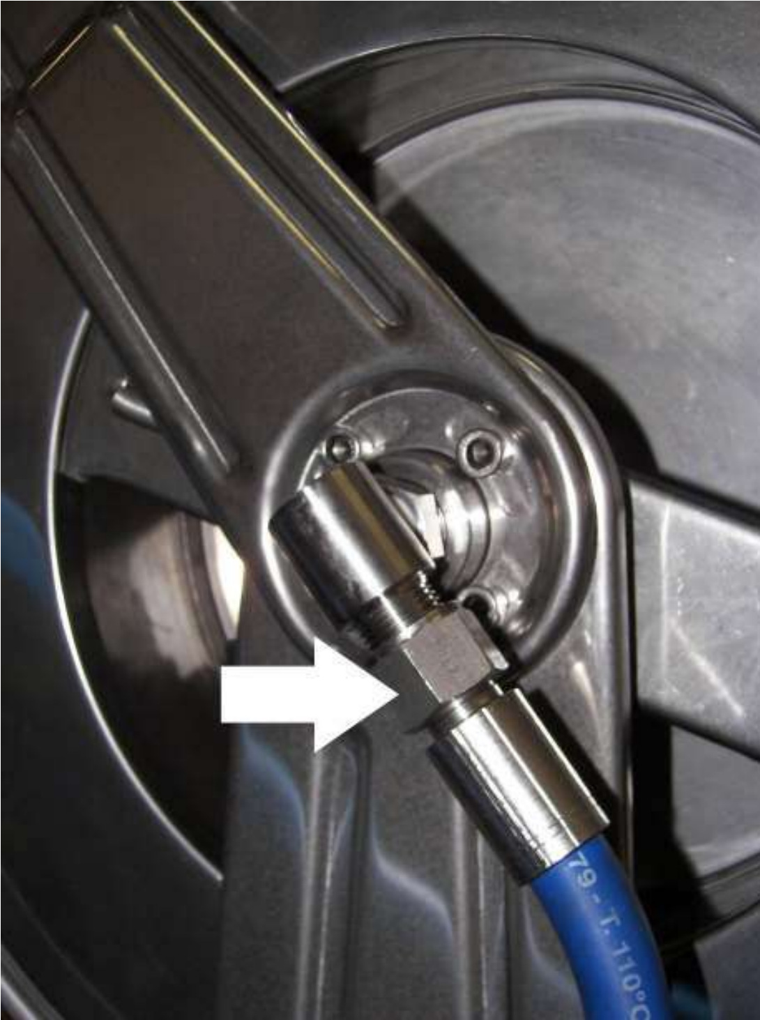
Connect the "water+chemical" 1/2" hose inlet on the 1/2" swivel joint.